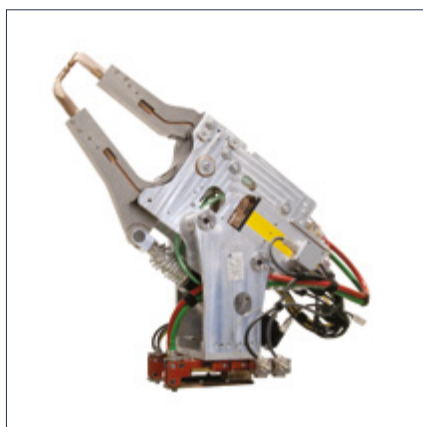
V6-X Robot Welding Gun