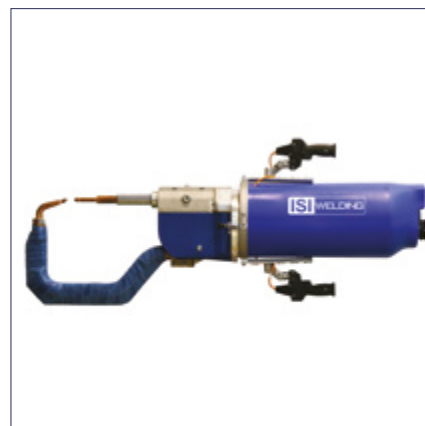
NPTI Manual Welding Gun