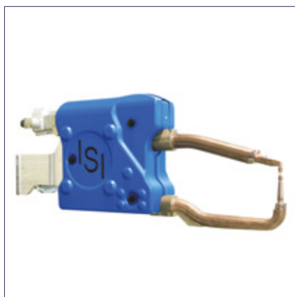
V4-X Robot Welding Gun