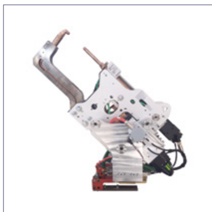
V6-C Robot Welding Gun