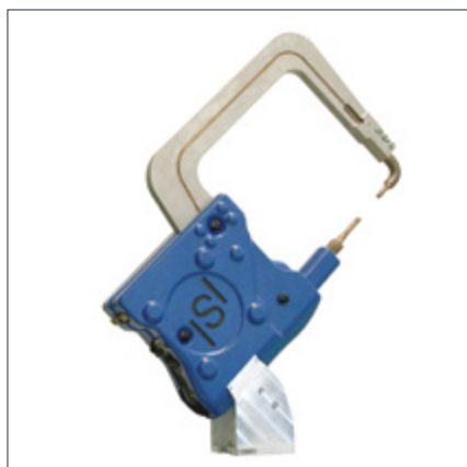
V4-C Robot Welding Gun