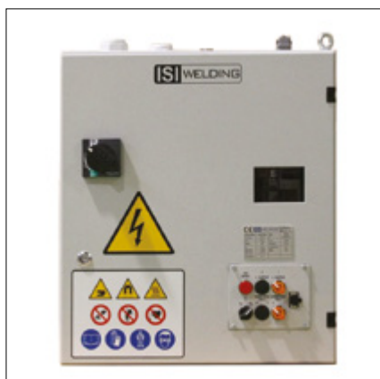
Welding Control Cabinet