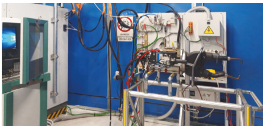
Welding Gun Testing Bench